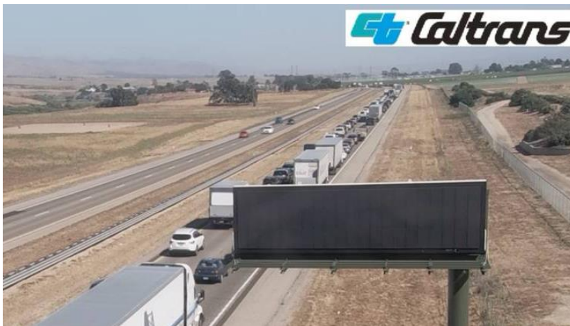
FIGURE 1: Southbound 101 in Nipomo Summer 2023 @ North of Teft looking South. Typical daily commuter traffic.

Commuter traffic on the 101 is already problematic. Daily traffic commutes to go from neighboring Arroyo Grande to Santa Maria ( 15 miles) can range from 30 to 60 minutes. With the influx of 4800 new residents, and the daily miles travelled in their cars will certainly compound the traffic congestion on 101 and virtually all surface streets. (see figure1)